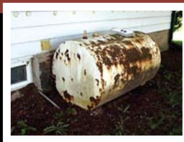
Aged Oil Tank

Caution: If you detect the odour of fuel oil, do not attempt to mask the odour with any type of masking agent. It is recommended that you find the source of the odour, take corrective action to eliminate any leaks and remove both surface and absorbed fuel oil.