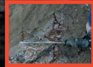
Earth below an oil tank spill.