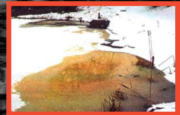
The damage can be extreme.